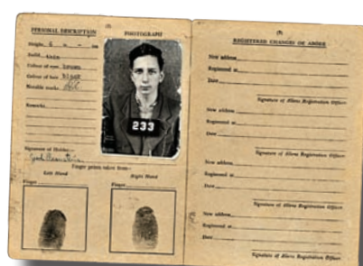
Papers of Bern Brent Manuscripts Collection, AC 09/076