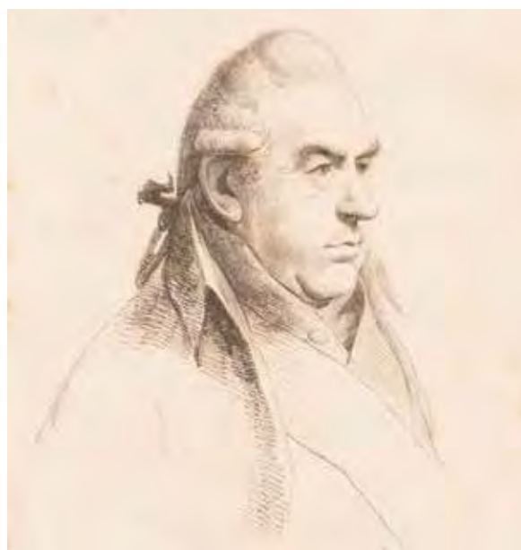
The Right Honourable Sir Joseph Banks, K.B. 1803 by William Daniell (1769–1837) after George Dance (1741–1825) soft ground etching NK490